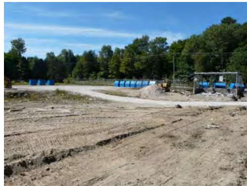
Caged bin being replaced by blue bins, which are bear proof. It is not only public works responsibility to use the bins, but the community's as a whole to help keep the environment clean.

As we can see, a lot of work has been put into cleaning up at the dump. Already there have been attempts by the bears to break into these bins and they did not have much success at it. In some of the pictures, you can see signs of their attempts with the mud stains that show their paw prints on the bins. The Vultures are still hanging around for a chance to get at the garbage, but they cannot do it.