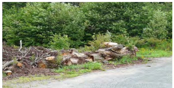
The site where a swing was made from this old tree. A lot of the local children, through the years had a lot of fun, swinging and hanging out

Another story goes like this, long ago, not sure exactly when in the early part of the 1900s, maybe around the 20s or 30s, there was the story of the horse thief. Apparently he was drunk and he needed to get home, so he stole a horse from one of the farms either in the Dean Lake area or Bruce Mines area. They caught up with him behind where MacIvers motel is now. The old highway used to run behind MacIvers before they