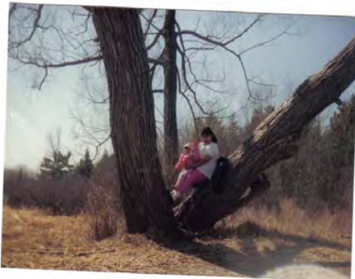
Pictured here is Jamie Morningstar and Pamela Morningstar posing for a picture at the monkey tree. This tree was a favorite play area for the local children. A swing was set up for the children to enjoy.

The monkey tree was a huge willow tree along the old highway 17 route through Cadaville. The swing was added in the early seventies and became a favorite hang out for the local children of the area. Even I remember this tree. I