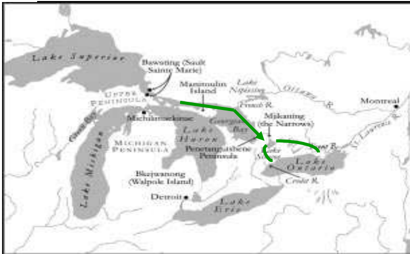
Figure 1—Migration route of the Mississauga's from Mississauga Bay, down along the shores of Georgian Bay to Lake Simcoe and down to Toronto and around the Six Nations—East of Lake Simcoe to Rice Lake, Curve Lake and Scugog —Route Taken

By Paudash, son of Paudas, Son of Cheneebeesh son of Gemoghpenassee.